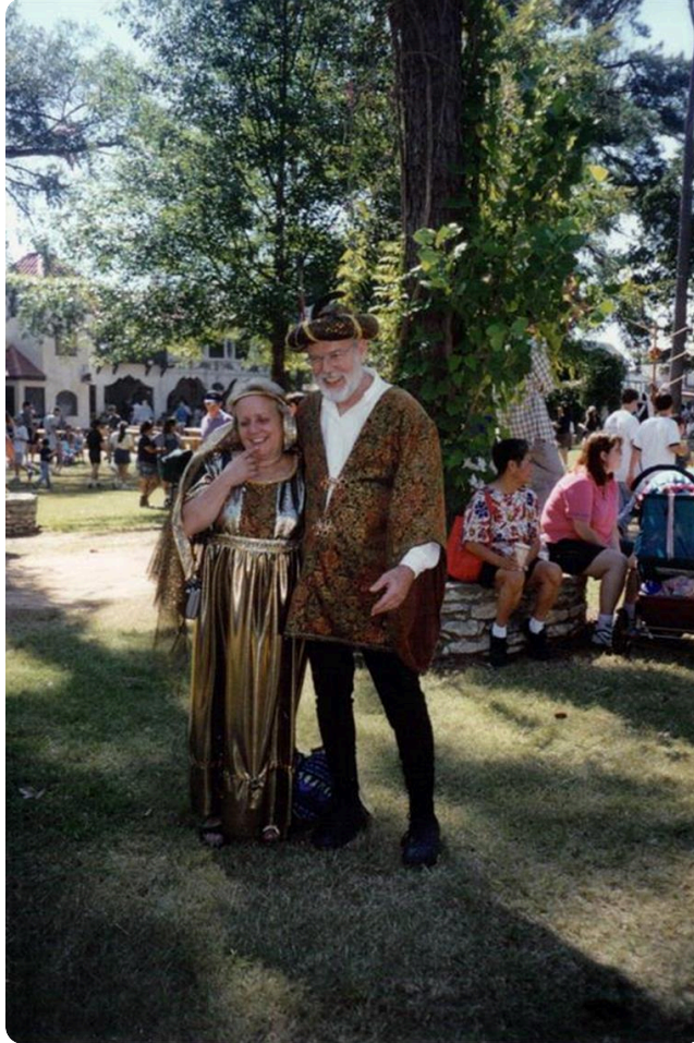
renaissance festival texas